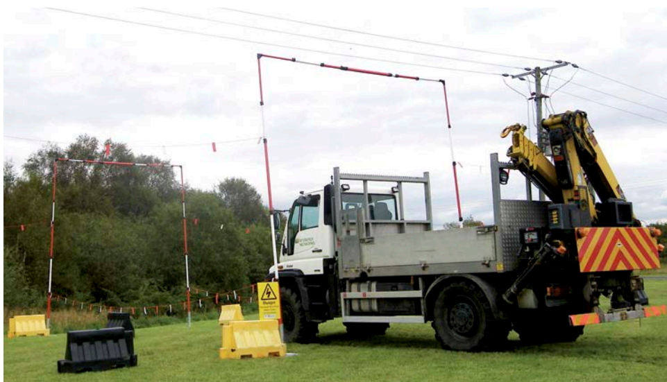
Figure 5 Typical passageway through barriers